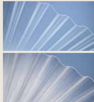
Cross-section of PLEXIGLAS® Resist WP 130/30 (dimensions in mm)